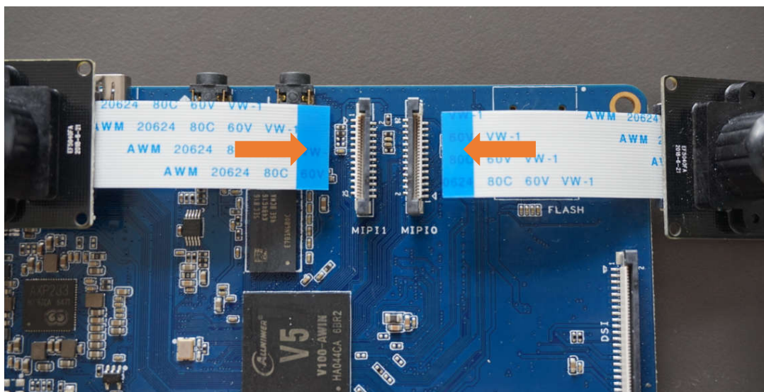
Figure 3: How to connect the cameras to the V5 board